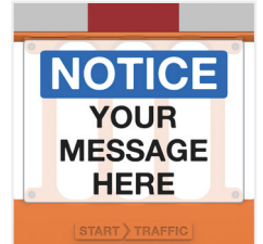
Cross-Trench Extra Ballast Add Signage