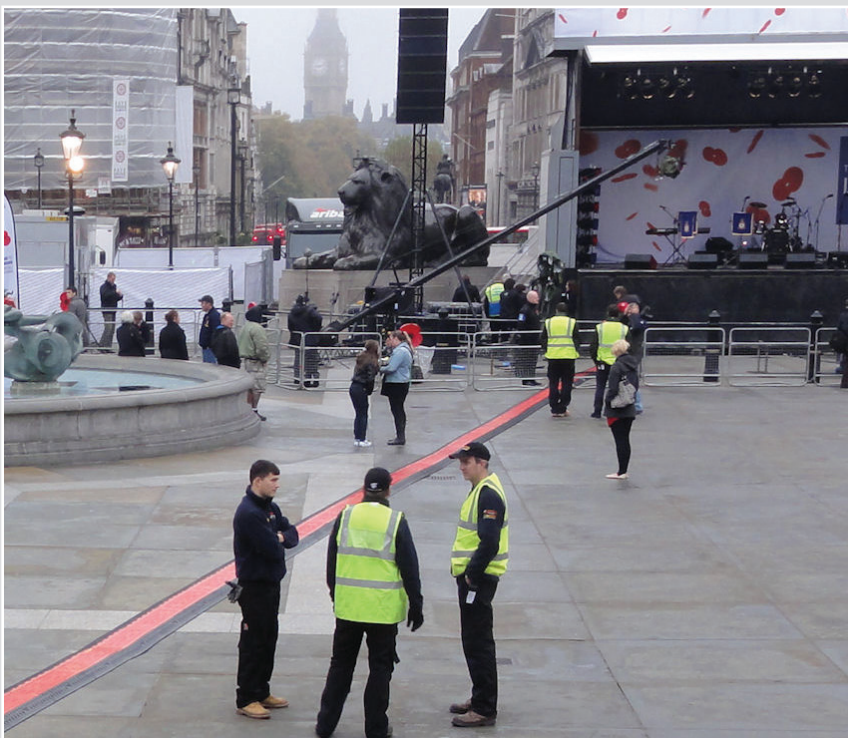
Guard Dogs in use at a outdoor concert venue