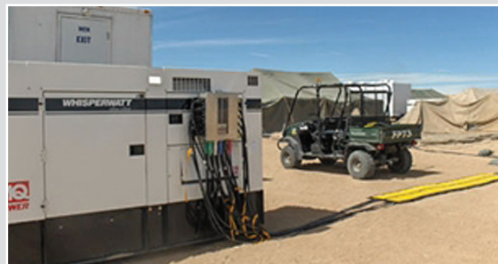
Yellow Jackets in use at a military operation