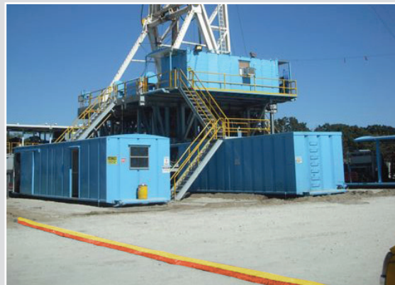
Linebacker Heavy Duty in use at a drilling rig