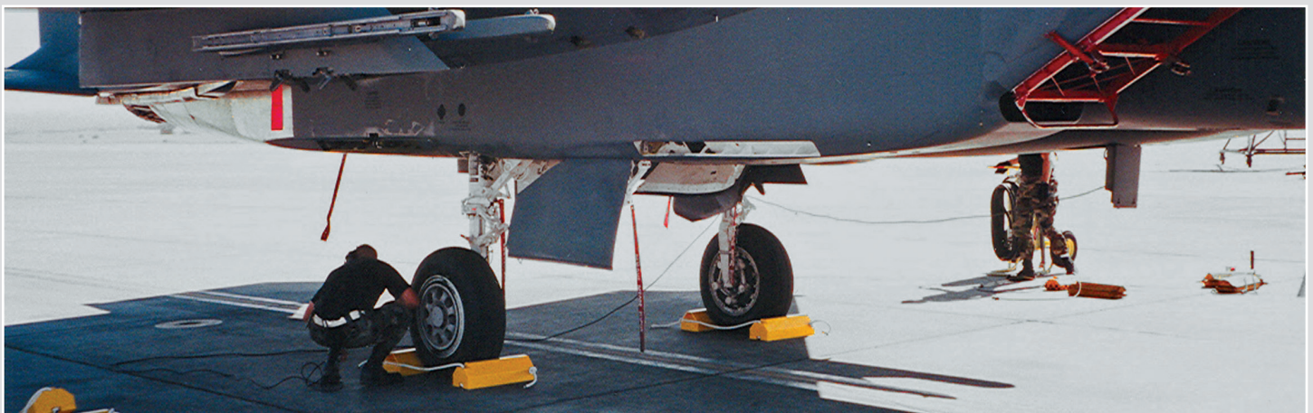
Monster AC6820-LR aviation chocks used on a McDonnell Douglas F-15 Eagle